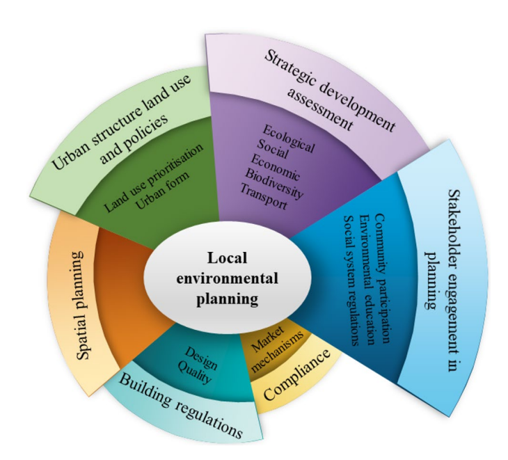
Figure 2. Conceptual model for local environmental land use planning in Anambra State, Nigeria